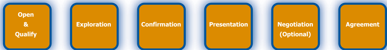
△ Diagram 1

Participants learn how to shorten buying cycles and test the interest of the prospect by continuously moving the buying process forward through enforcing the concept of getting the prospect to commit to the next step in the process in the form of a next calendar event. They also learn to get the prospect to help develop the proposal that 'makes sense' to both parties, through the use of an outline or yellow pad technique.